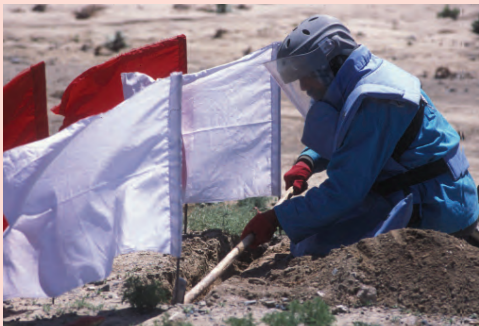
Over 1,900 hazardous areas, covering 112 square kilometres of land, were cleared during 2012.

Having experienced violence for much of the last 35 years, Afghanistan has witnessed widespread and indiscriminate use of mines and munitions during its protracted conflict, making it one of the most heavily mined countries in the world. Its mine action programme – known officially as