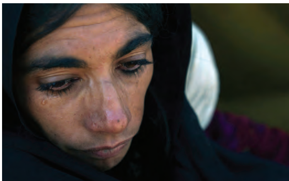
A large number of cases of violence against women are still resolved through informal mechanisms.

Of concern, the report found that the overall number of criminal indictments filed by prosecutors in violence against women cases under all applicable laws decreased this year despite the rise in reported and registered incidents. ■