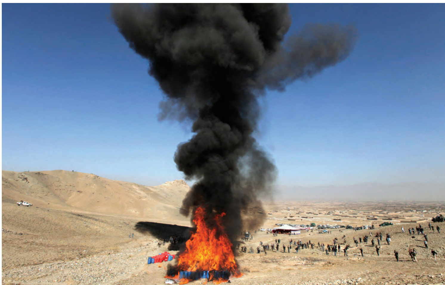
Authorities burnt over 20 tons of illicit drugs in November 2013.

UN officials have said in the past that Afghanistan’s “large-scale drug economy” is one of the drivers of instability in the coun-