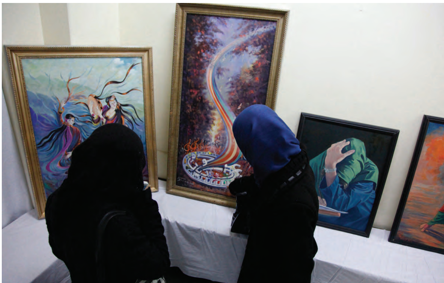
Students admire some of their fellow students’ paintings.

The RQM programme falls within IOM’s strategic focus of maximizing the relationship between migration and development. Through the request of the Government of Afghanistan, IOM is mandated to assist with orderly and humane migration. Its programmes in Afghanistan are implemented in close cooperation with national government counterparts and are designed to support the goals of the Afghan National Development Strategy. ■