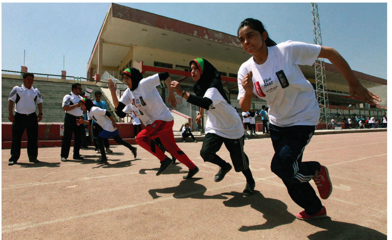
Security and social perception are key challenges for women's sports.