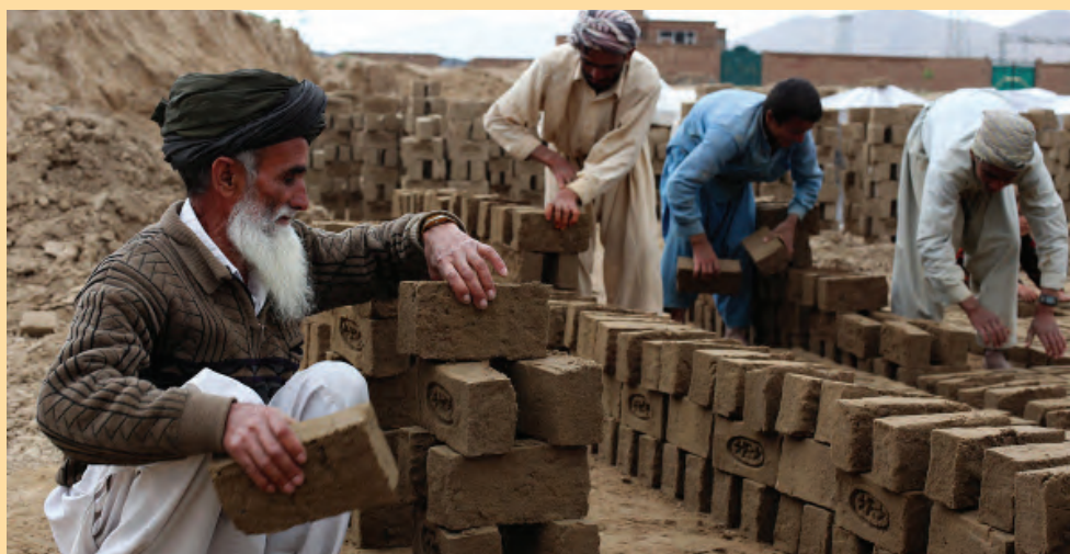
Job creation remains a key challenge.

The study also projected a weak economic outlook in 2014 before picking up in 2015 “assuming a smooth political and security transition,” but “much will depend on Afghanistan’s success in achieving peace, sta-