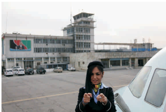
"I am a flight attendant. If I did it, You can do it too"

I am pleased to introduce this special edition of "Afghan Women and the United Nations" and especially pleased to dedicate it to the efforts of girls and women who contribute to a peaceful, developed and prosperous Afghanistan.