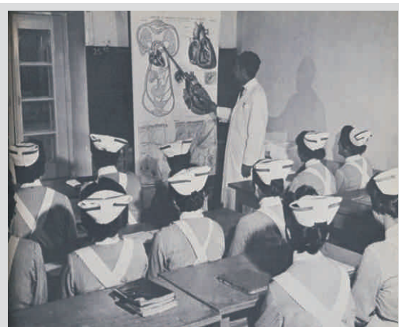
Studying medicine in the 1960s and today