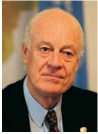
by Staffan de Mistura Special Representative of the United Nations Secretary-General for Afghanistan

The participation of women and girls in today's Afghanistan is more crucial than ever in shaping the nation of tomorrow