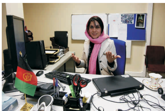
"I am a manager. If I did it, You can do it"