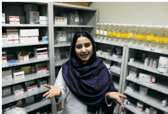
"I am pharmacist, If I did it, You can do it"