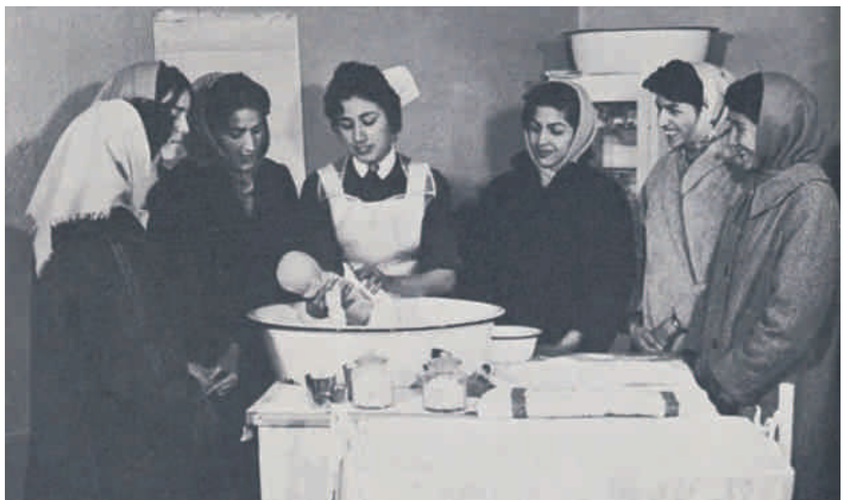
A woman leading a prenatal class in Kabul in the 1960s.