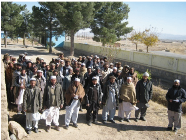
Community members recruited for training as deminers

Mine Clearance and Planning Agency (MCPA) is conducting this one year project through which the community based demining teams will clear more than one square kilometre of suspected hazardous area.