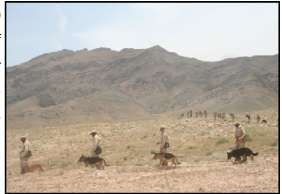
MDD teams returning from demining operation in Charasyab district / June 2009

The Mine Action Coordination Centre of Afghanistan (MACCA) supported by the United Nations and the Government of Afghanistan through its Afghanistan National Disaster Management Authority (ANDMA)/Department of Mine Clearance (DMC) have formed a partnership within the MACCA offices to plan, coordinate and ensure the quality of all mine action activities in Afghanistan. The most recent Inter-ministerial board meeting was held in March, key topics discussed included information exchange between ministries of Aynac copper mine.