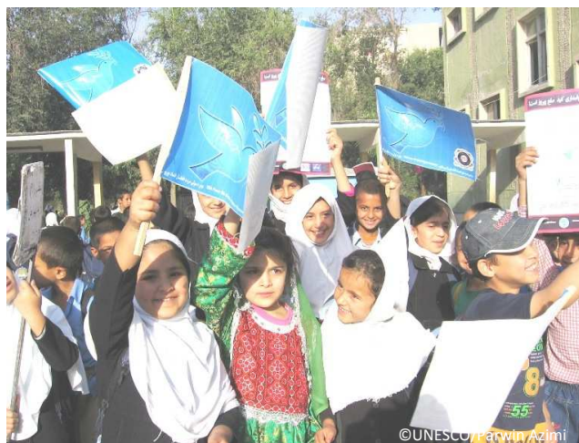
School children in Kabul advocate for peace

The UNESCO Kabul team focuses its efforts to empower Afghan people through quality education, cultural dialogue and the free and