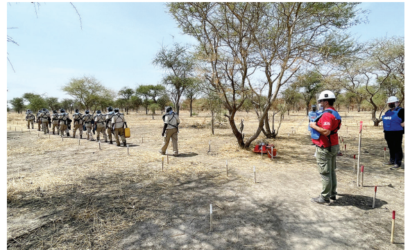
Quality assurance visit to Koladit minefield