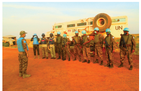
Ground monitoring mission at TS-21