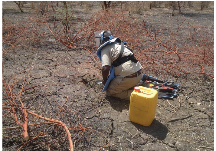
Excavation of the hazard