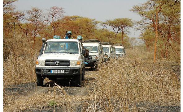
Route assessment convoy returning from Hedid