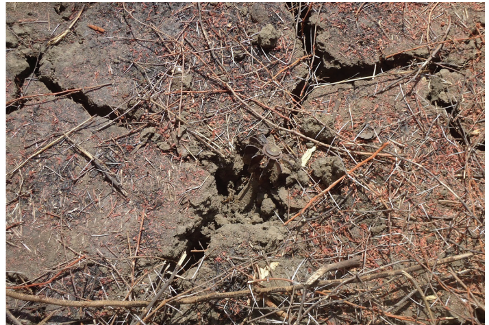
Explosive hazard reported by the local community members