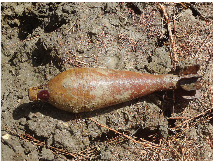
An example of 82 mm mortar

The two informants who live in the area where the explosive device was found, expressed their gratitude to UNMAS and UN police for their prompt response. Once the demolition task was completed, the team informed Mr Bol Deng, one of the informants, that the threat had now been eliminated.