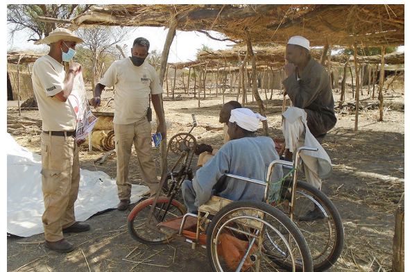
Non-technical survey in Um Khariet