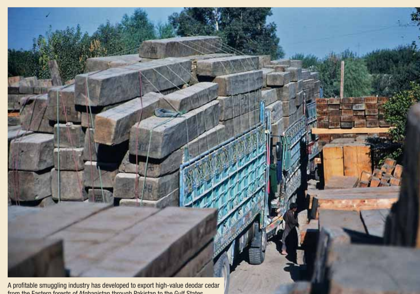
A profitable smuggling industry has developed to export high-value deodar cedar from the Eastern forests of Afghanistan through Pakistan to the Gulf States