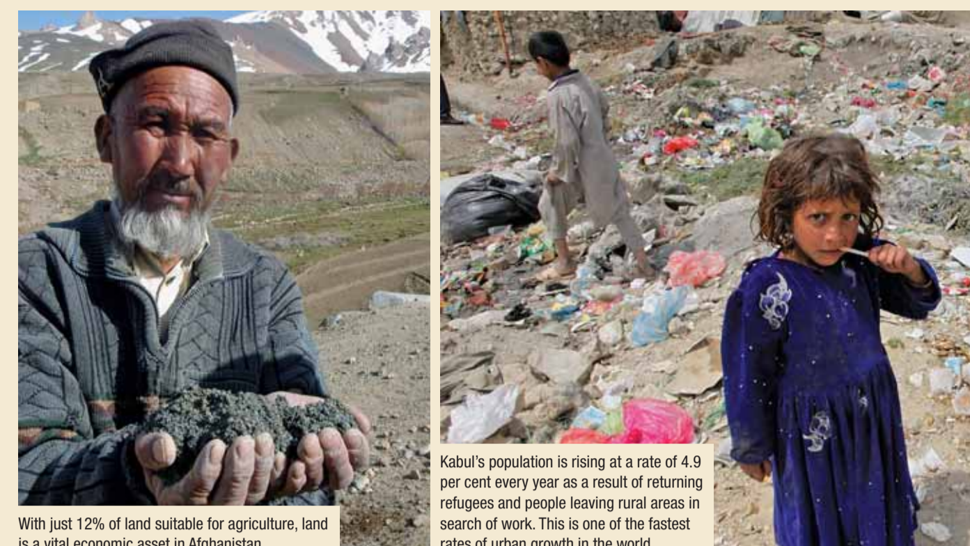
With just 12% of land suitable for agriculture, land is a vital economic asset in Afghanistan