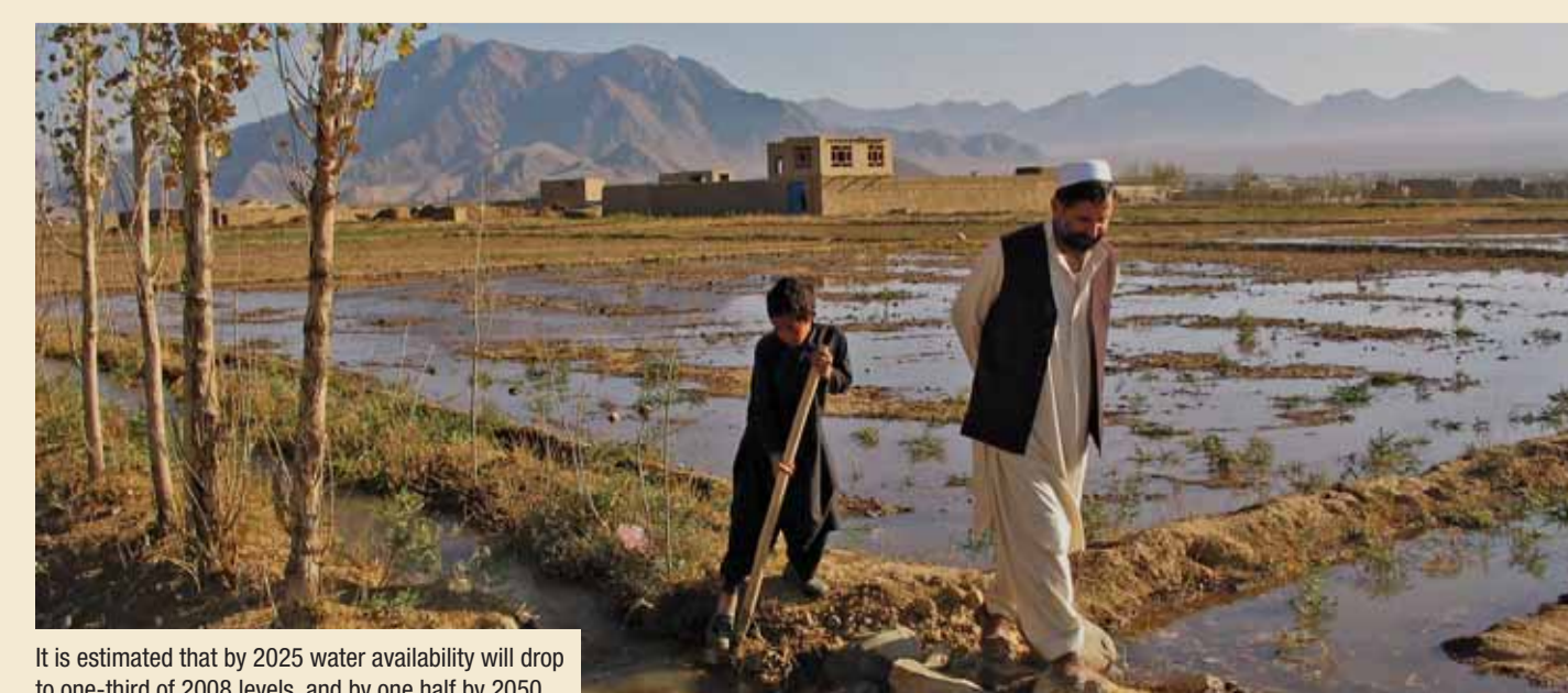
It is estimated that by 2025 water availability will drop to one-third of 2008 levels, and by one half by 2050