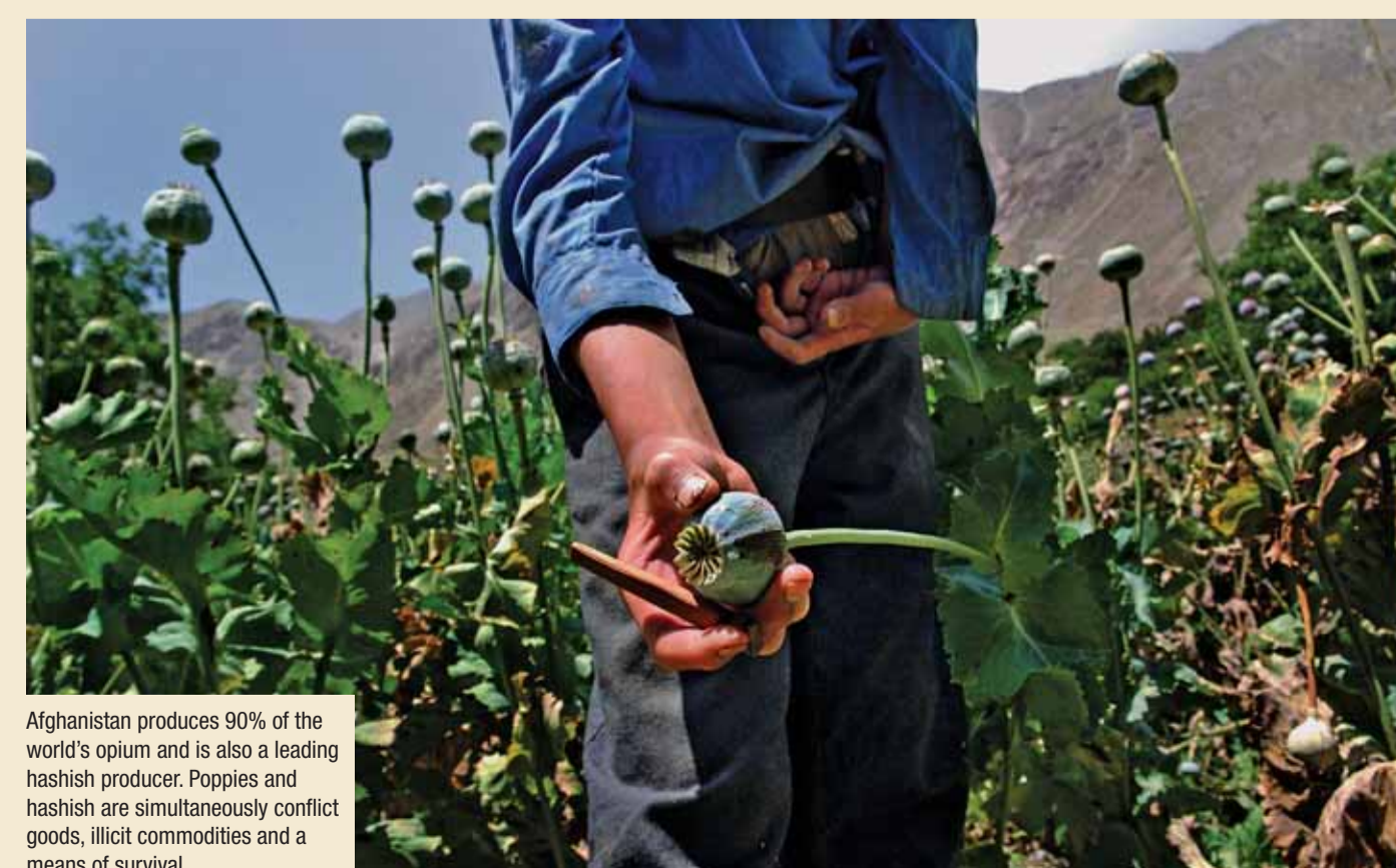
Afghanistan produces 90% of the world's opium and is also a leading hashish producer. Poppies and hashish are simultaneously conflict goods, illicit commodities and a means of survival