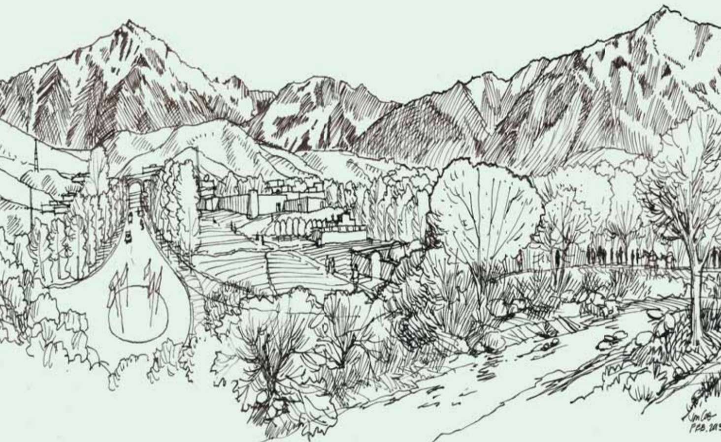
United Nations Country Team in Afghanistan